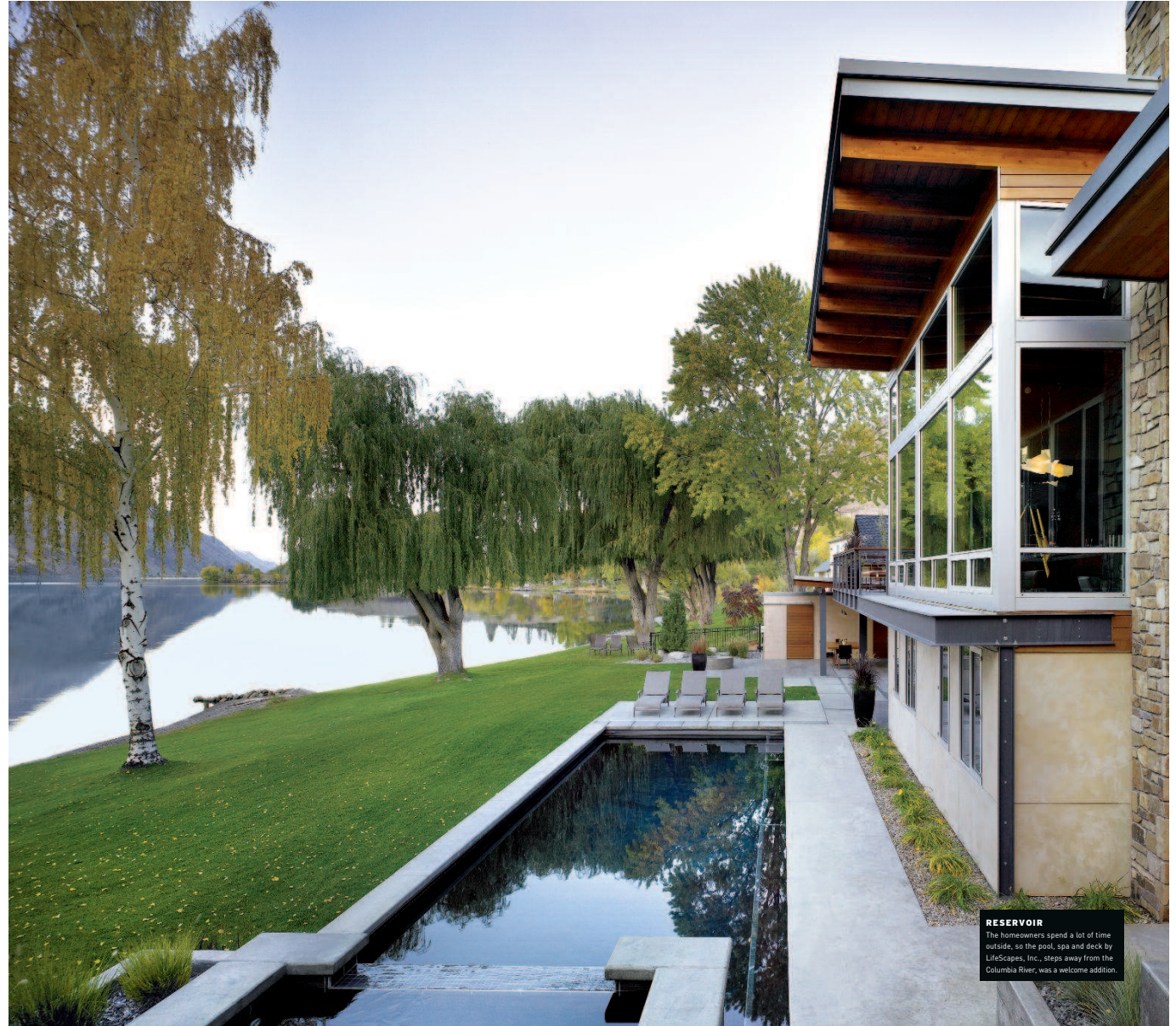
RESERVOIR The homeowners spend a lot of time outside, so the pool, spa and deck by LifeScapes, Inc., steps away from the Columbia River, was a welcome addition.