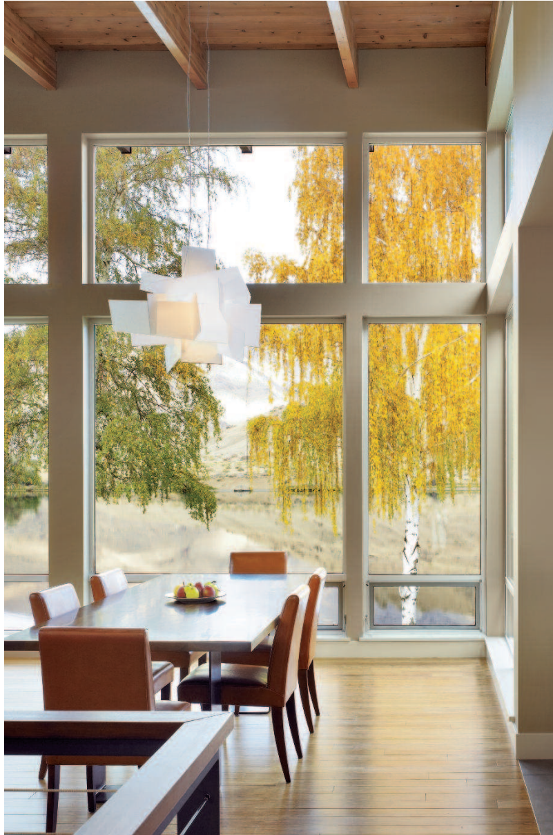
LIGHTEN UP Natural light floods the dining area, where leather-and-wood chairs from Kasala gather around a solid walnut table with fabricated steel legs that was custom designed by the homeowners.