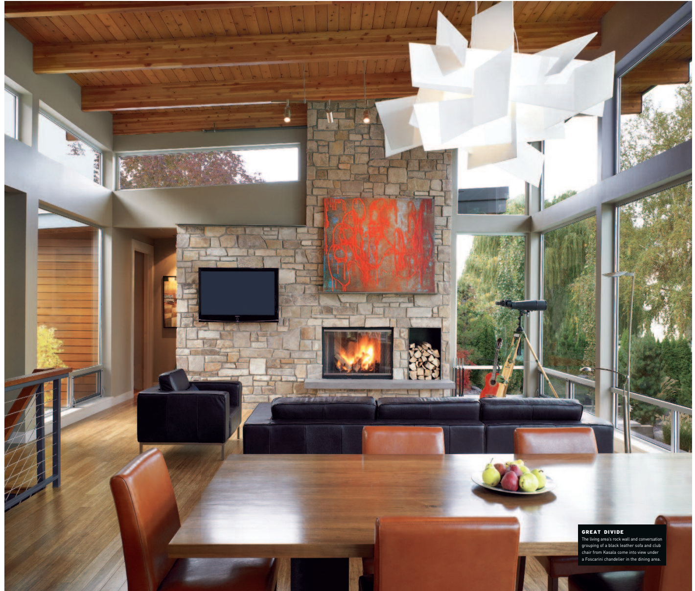
GREAT DIVIDE The living area's rock wall and conversation grouping of a black leather sofa and club chair from Kasala come into view under a Foscarini chandelier in the dining area.