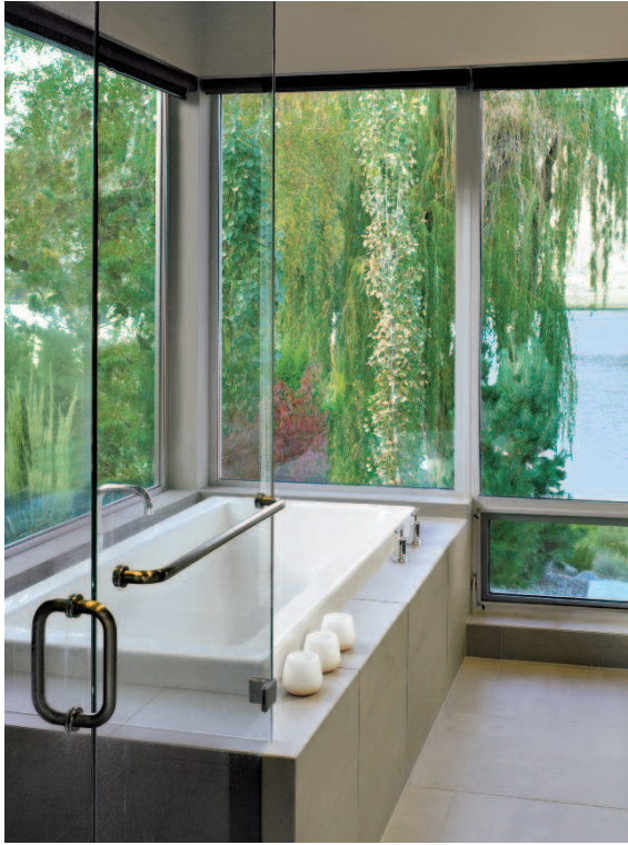
CRYSTAL CLEAR Glass walls envelop the master bathroom, where a Jason Hydrotherapy tub sinks into a gray surround from United Tile.