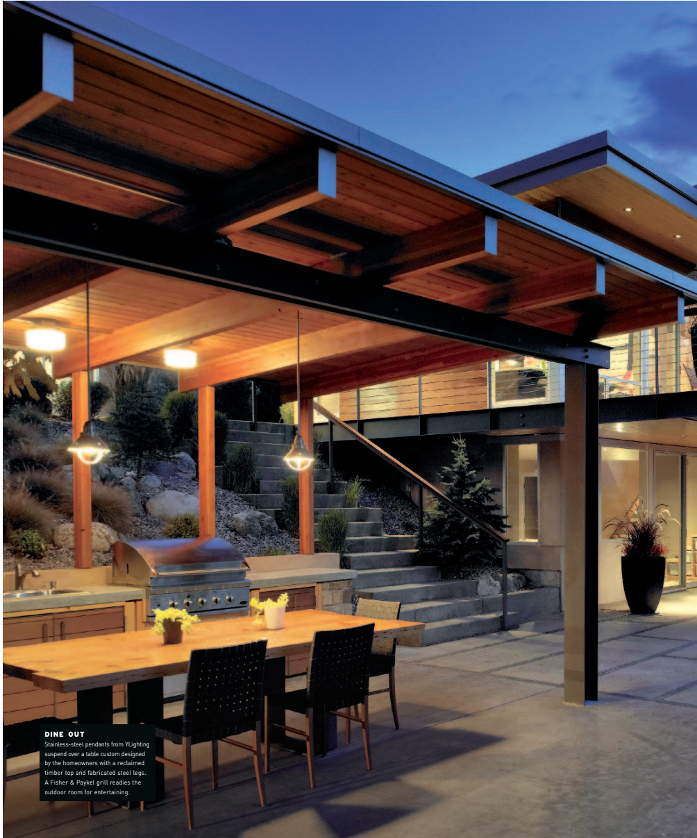
DINE OUT Stainless-steel pendants from YLighting suspend over a table custom designed by the homeowners with a reclaimed timber top and fabricated steel legs. A Fisher & Paykel grill readies the outdoor room for entertaining.